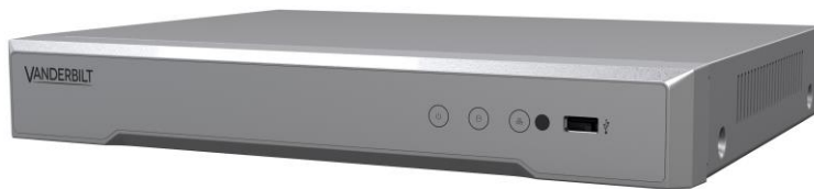
Eventys EX16 NVR, CRDN1610-PA

Eventys EX series NVR (Network Video Recorder) is a new generation of cost-efficient but technical high-grade recorder. Combined with multiple advanced technologies, such as audio and video decoding technology, embedded system technology, storage technology, network technology, intelligent VCA technology, integrated PoE switch and Alarm I/O. Eventys EX NVR supports recording of up to 16 IP video streams of up to 8 MP (4K / UHD) resolution. The integrated 16 channel PoE switch allows direct connection of PoE capable IP cameras without additional power supplies. The Eventys EX series NVR is suitable in the areas of small up to medium stand-alone installations.